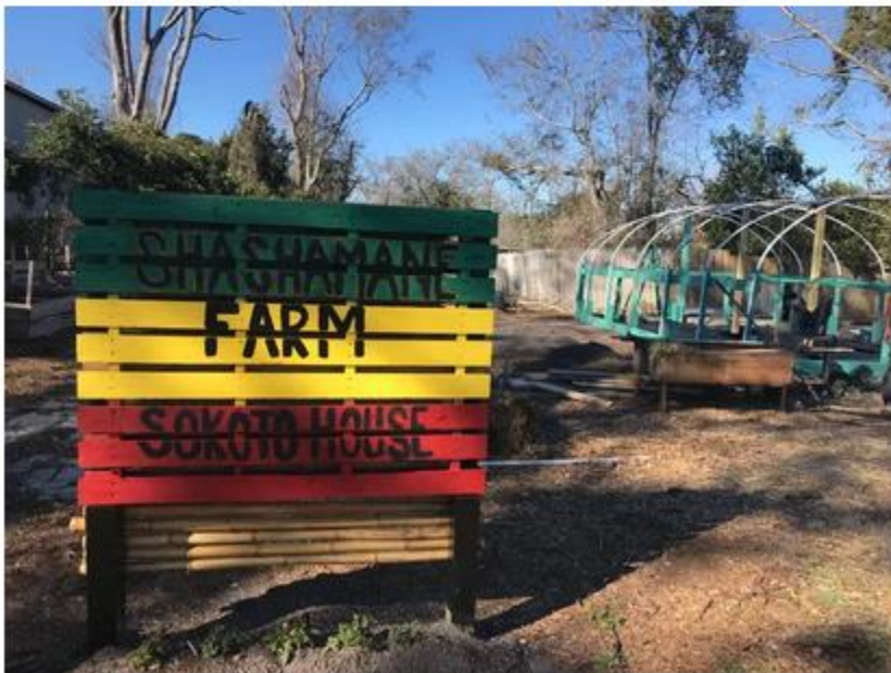
Shashamane Farm is under construction at Sokoto House in Wilmington.